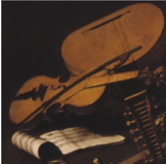
Caravaggio Amor as winner

A key action, supported by the project, is to have created synergies and integrations between the policies of the European Commission or other trans-national organisations and those of Member States. At a little more than a year since its beginnings, Minerva has demonstrated concretely to have contributed to the creation of a broad consensus on the European framework derived from the e-Europe initiative, which gave birth to the Lund Principles, the Lund Action plan and the National Representatives Group. This consensus constitutes the basis for the definition, the validation, and the adoption of international standards and guidelines which, promoted by governments with the support of the European Commission, will be directed to many categories of beneficiaries: central and dislocated public administration departments, local entities, small and medium sized businesses, publishers, universities, research centres, cultural institutions, etc.