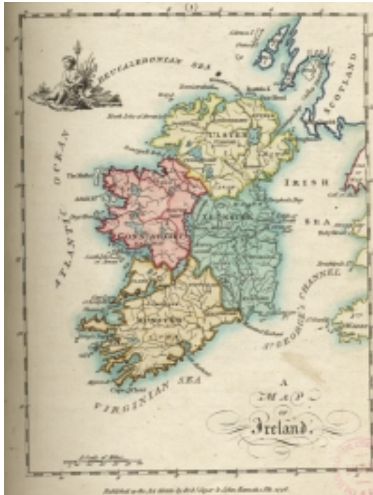
Map of Ireland Scale, Bernard, An Hibernian Atlas, 1776

The eEurope 2002 Action Plan was endorsed by EU Member States at the Feira European Council in June 2000. Objective 3(d) of the Action Plan is to stimulate European content in global networks in order fully to exploit the opportunities created by the advent of the digital technologies. Within that objective there is a specific action for Member States and the Commission jointly to: create a co-ordination mechanism for digitisation programmes across Member States.