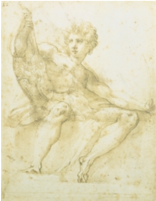
Francesco Mazzola called Il Parmigianino Apollo or David (detail) Parma, Galleria Nazionale