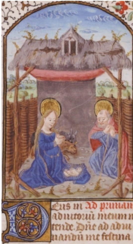
Livre d'heures à l'usage de Luxembourg, BnL, Ms 52, fol. 89, XV th century