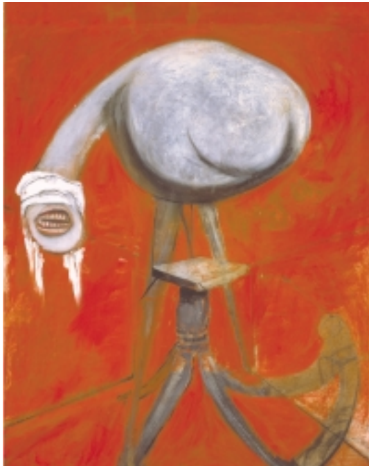
Francis Bacon Three studies for figures at the base of a Crucifixion , detail circa 1944 © Tate, London 2003