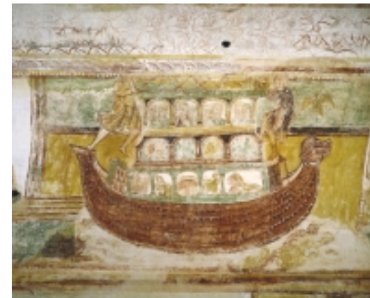
Eglise, voûte de la nef, septième travée, registre supérieur nord: l'arche de Noé sur les eaux du déluge