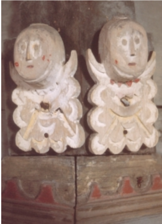
Petäjävesi Old Church, Petäjävesi, Finland Detail