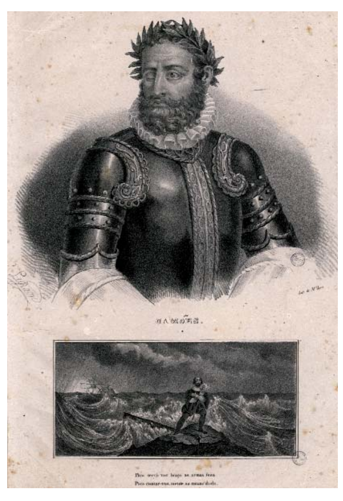
Charles Legrand, Camões . Lisboa, [1841], litography