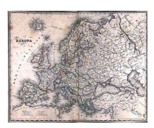
Adrien Balbi, Atlas da geographia universal , Paris, J. P. Aillaud, 1839

Matriznet Project Portuguese Museums Online MatrizNet, the public interface of Matriz, materializes a major goal defined by the Portuguese Institute of Museums in what concerns its policy towards research and disclosure of the collections safeguarded by its museums. This action is integrated on the eEurope Action Plan in what relates to the production of European digital content for the world networks and is also integrated on the Internet Initiative in what concerns the digitisation and availability of public content, namely from museums. MatrizNet makes available on the internet, information about