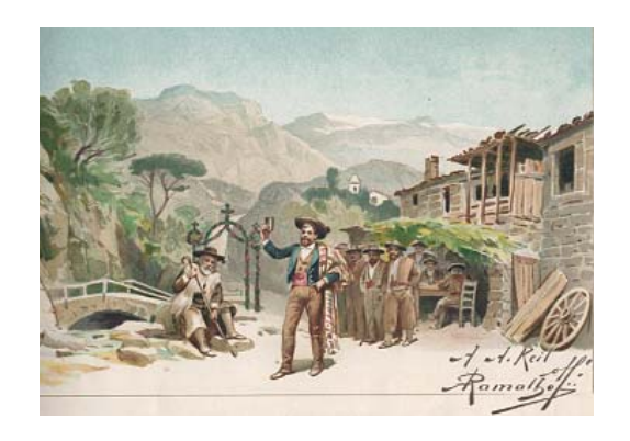
Alfredo Keil, music; Henrique Lopes de Mendonça, verses Serrana: ópera em três actos. 189. Act 1, Scene 1

possible to view abstracts from multiple search criteria as keyword, author, title, year, and publisher. Until December 2004 this portal registered more than two million downloads of scientific articles. The next step of B-on will include the Portuguese National Library (BN) cooperation: the BN is developing an on-line platform with the entire thesis produced by the Portuguese academic community, previously digitised by BN. That platform will also allow the access and search in PORBASE-data base of all the Portuguese Public libraries.