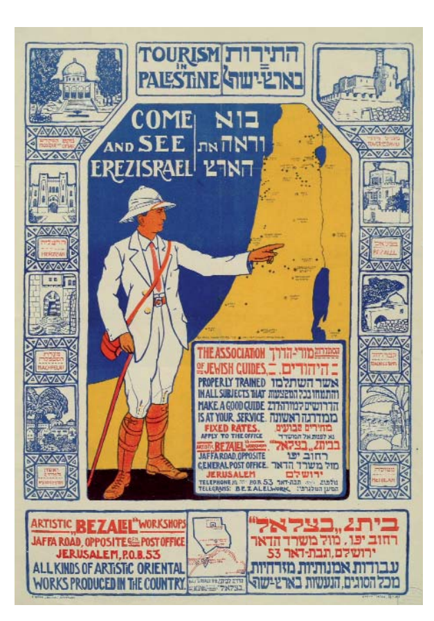
Tourism in Palestine © Central Zionist Archives

Food Controller – Rationing Poster © Central Zionist Archives