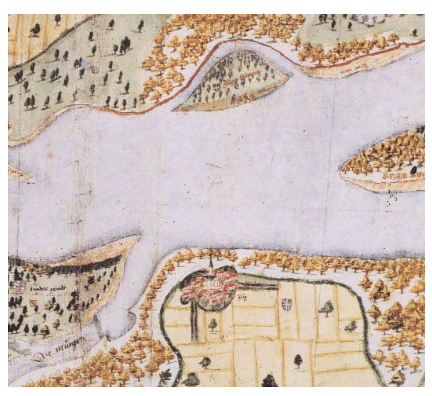
Rhine map from Kurpfalz, ca. 1595